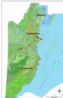
3 study areas on a North-south gradient