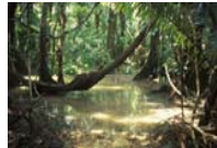
Cockscomb Basin Wildlife Sanctuary