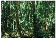
Fireburn Forest Reserve

To relate past and present landuse to biodiversity and attempt to identify indicator species that could be used to demonstrate conservation status.