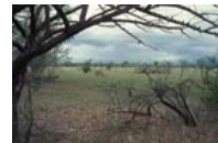
Crooked Tree Wildlife Sanctuary